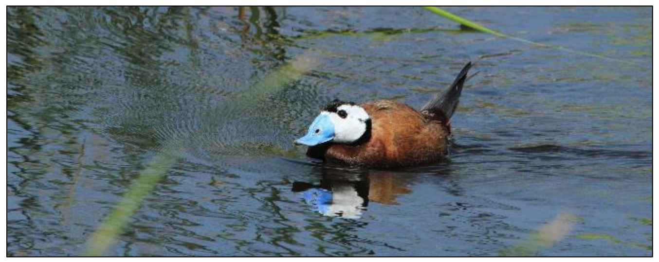
Male White-headed Duck

April 24-25, Days 3-4: Doñana National Park. Doñana was declared a national park in 1969 with more than 300 species of birds recorded. Doñana National Park is recognized as a Ramsar Convention "Wetland of International Importance," an Audubon "Important Bird Area" (IBA) program, and a UNESCO "World Heritage Site." Among its 127 breeding species, some of them globally threatened, we should not forget to mention White-headed Duck, Marbled Teal, Red-knobbed Coot, Spanish Eagle, Squacco Heron, Purple Heron and Red-crested Pochard. The different ecosystems present in Doñana and the surrounding areas provide excellent chances to record quite a high number of species.