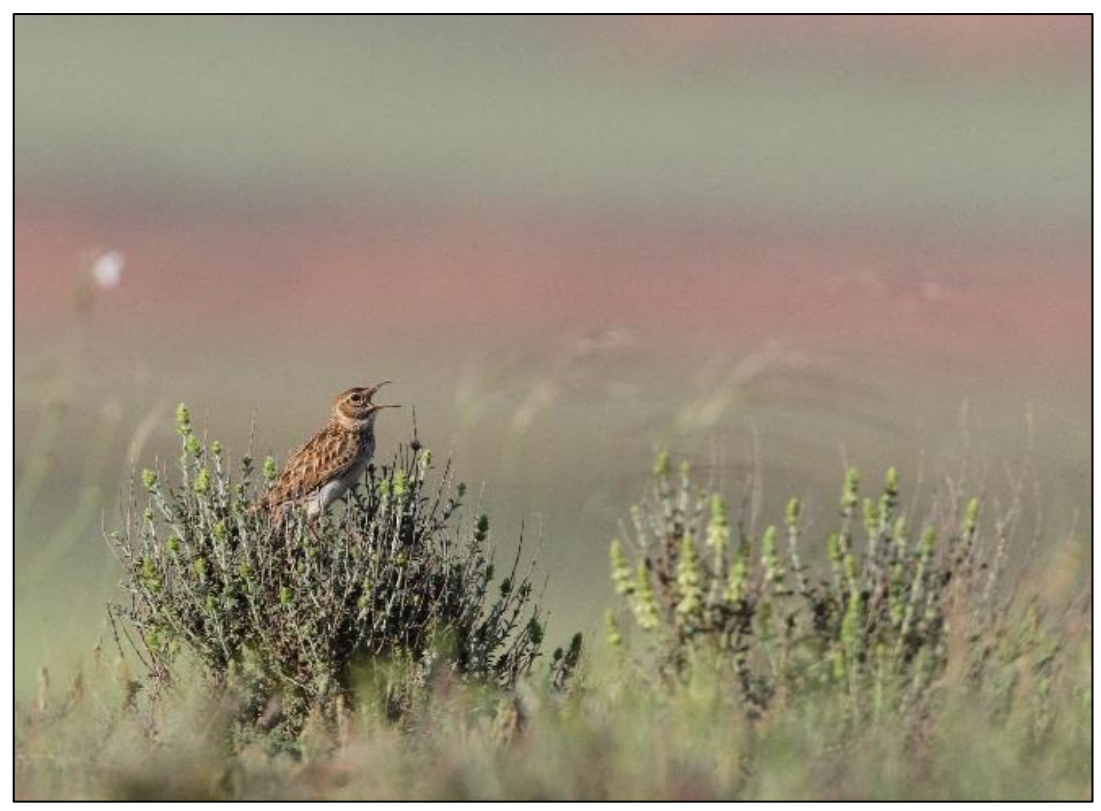
DuPont's Lark singing at El Planeron Reserve

birds we haven't seen yet. After a late breakfast we will depart mid-day for Madrid, where we will enjoy a final checklist session and farewell dinner.