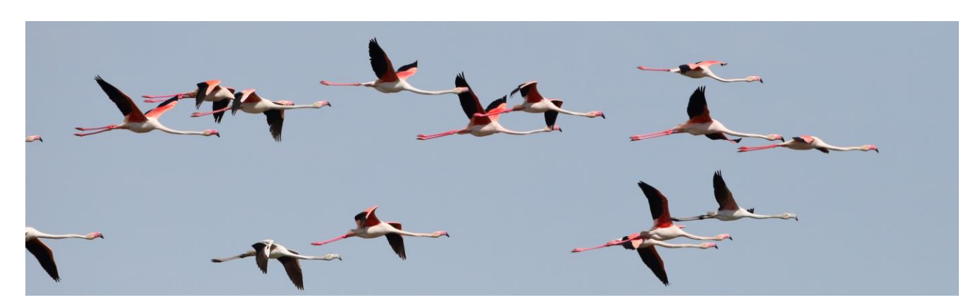
Greater Flamingos are a common sight at Doñana National Park

Europe. Squacco Herons, Collared Pratincoles, Black-winged Stilts, Whiskered Terns, Greater Flamingos, Eurasian Spoonbills and Glossy Ibis are abundant, while Little Bittern, Red-crested Pochard, Red-knobbed Coot, Rufous-tailed Scrub-Robin, Western Olivaceous Warbler, Great Reed Warbler, Audouin's Gull, Iberian Chiffchaff and the endangered Spanish Eagle are all present. Besides, Doñana is one of the last refuges for the Iberian Lynx, one of the most threatened felines in the world.