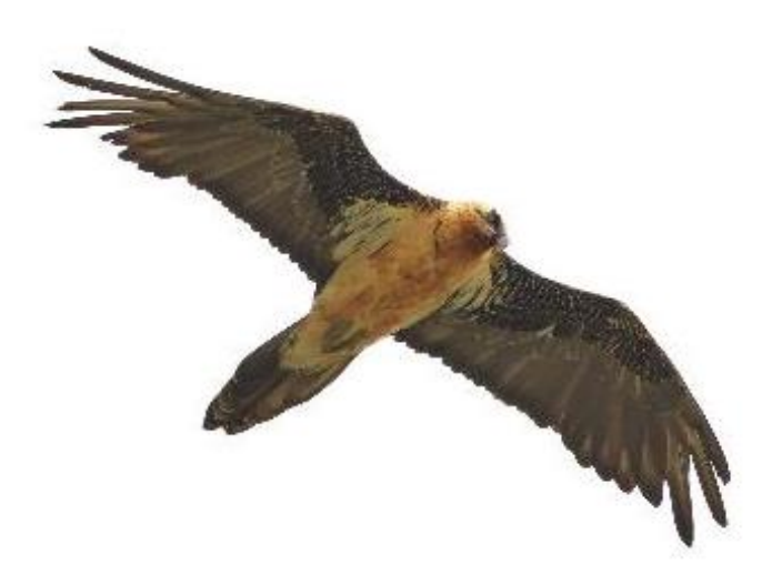
Bearded Vulture in the Pyrenees

May 5-6, Days 14-15: The High Pyrenees. Two full days based in the Hecho Valley will give us optimal chances of finding alpine species. One day will be spent travelling to higher Pyrenean Mountain passes at 6-7,000 feet elevation amidst spectacular scenery. Target species at these heights, from just below the tree-line to the open alpine zone, are Alpine Accentor, Citril Finch, Eurasian Crag-Martin, Water Pipit and Yellow-billed Chough. Our second day may be spent visiting wooded regions or traveling further west to different beautiful mountain habitats in search of new birds like Marsh Tit. Common Firecrest, Eurasian Bullfinch, Red Kite, Yellowhammer, Eurasian Jay, and Red Crossbill. Our hotel is in a scenic valley surrounded by mountains and woods close to prime birding sites, particularly for Wallcreeper. This stunning crimson, gray, and black beauty is a regular breeding bird in the deep, steep, rocky gorges just minutes away from our