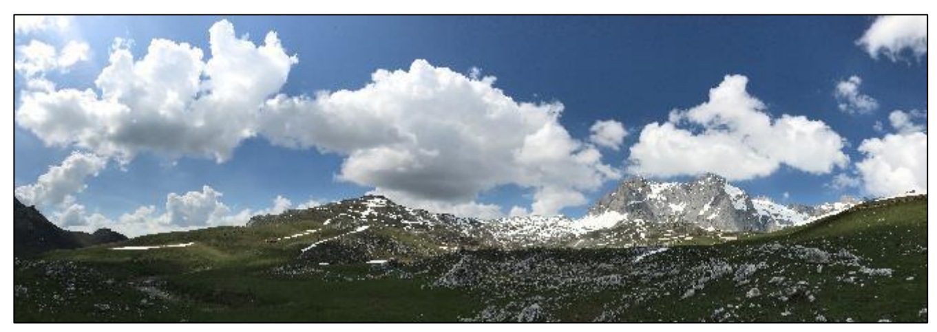
Picos de Europa

have magnificent villages, massively built of stone with immense walls. In the Pyrenees, there are old cathedrals, churches, monasteries and castles dating back to the twelfth to sixteenth centuries when Spain was divided into the separate states of Castile, Aragon, and Catalonia and occupied in some areas by the Moors from Northern Africa.